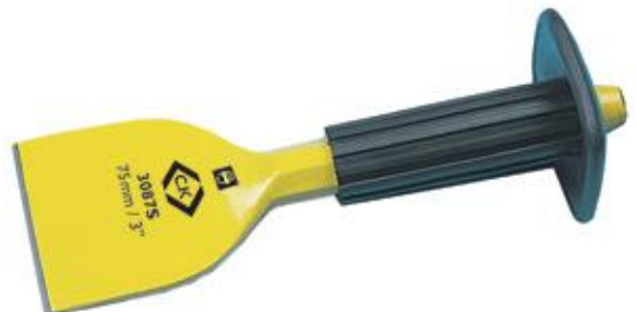
Brick bolster with grip