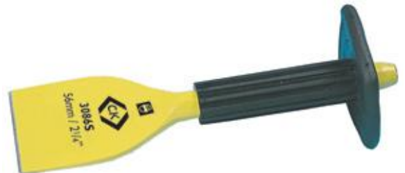
Electricians bolster with grip