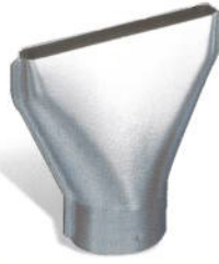
Surface nozzle 75 mm

Deflects to prevent panes of glass etc. from overheating