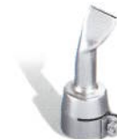
Flat angled nozzle 20 x 2 mm

For welding overlapped plastic sheeting, repair work on bitumen roofs