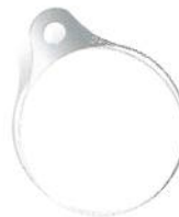
HL hanging loop (HG 2310 LCD)

holds the tool in position for a variety of work processes