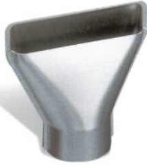
Window nozzle 75 mm

For shaping and shrink-fitting large diameters