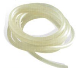
Plastic welding rod

for suspending from spring balancers in production lines