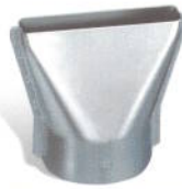
Surface nozzle 50 mm

Deflects to prevent overheating in narrow spots