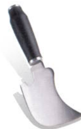
Quarter-moon crucible steel knife

Blade holder, nickel- plated, with replacement blades in wooden shank. Depth setting adjustable. For planing or lifting out the welding cord joint in vinyl and linoleum, PVC etc. Replacement blade ground on both sides