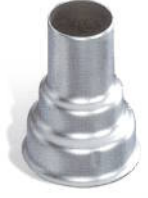
Reduction nozzle 20 mm

Pinpoint source of heat for de-soldering and for welding PVC