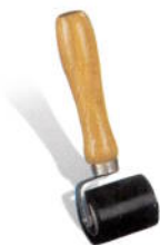
Unilaterally supported pressure roller, 50 mm