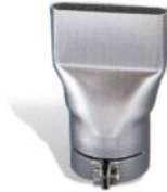
Flat nozzle 70 x 10 mm