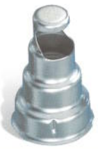
Soldering reflector nozzle

Pinpoint source of heat for de-soldering and for welding PVC