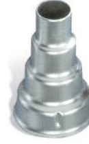
Reduction nozzle 14 mm

Spreads air over wider area for drying, paint stripping, etc.