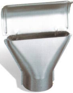
Large reflector nozzle