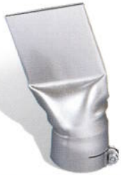
Flat angled nozzle 74 x 3 mm