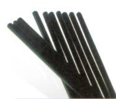
Plastic welding rod