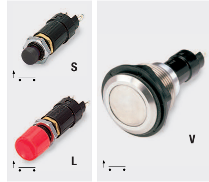
T0916S0 --- & T0916L0 ---