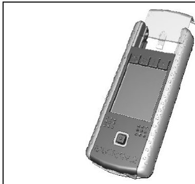
Figure 1. EvoPrimer base