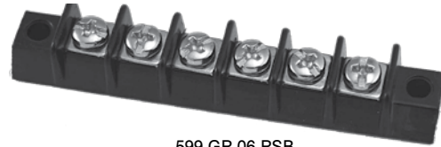
599 GP 06 PSB