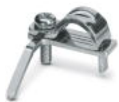
Shield connection clamp for printed circuit terminal block

Components of electronic housing - ME-SAS MINI - 2200456