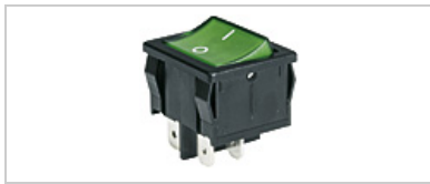
Similar to original product