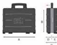
INTERNAL DIMENSIONS (mm)

* All models are also available in red color