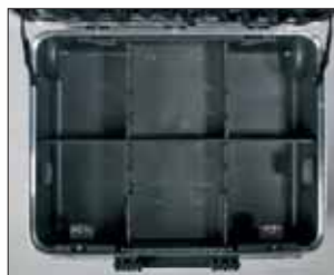
• Bottom area has removable dividers fixed directly on the shell body with no need of additional tray. Lightweight and higher load capacity are ensured.