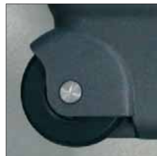
• Wheels on ball bearing