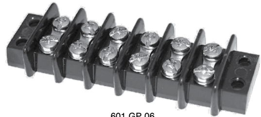
601 GP 06