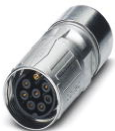
Cable connector, straight, SPEEDCON locking, M17, Number of positions: 5+3+PE, Type of contact: Socket, Crimp connection, shielded: Yes, Cable diameter: 9 mm...11 mm

Please be informed that the data shown in this PDF Document is generated from our Online Catalog. Please find the complete data in the user's documentation. Our General Terms of Use for Downloads are valid ( http://phoenixcontact.com/download )