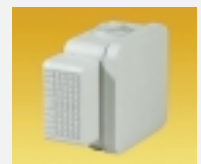
entries and accessories