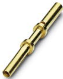
Crimp contact, turned, Contact diameter: 0.6 mm, Crimp range: 0.14 mm 2 ...0.34 mm 2

Please be informed that the data shown in this PDF Document is generated from our Online Catalog. Please find the complete data in the user's documentation. Our General Terms of Use for Downloads are valid ( http://phoenixcontact.com/download )