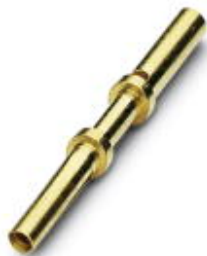
Crimp contact, turned, Contact diameter: 0.6 mm, Crimp range: 0.08 mm 2 ...0.25 mm 2

Please be informed that the data shown in this PDF Document is generated from our Online Catalog. Please find the complete data in the user's documentation. Our General Terms of Use for Downloads are valid ( http://phoenixcontact.com/download )