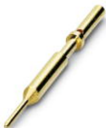
Crimp contact, turned, Contact diameter: 0.6 mm, Crimp range: 0.34 mm 2 ...0.5 mm 2

Please be informed that the data shown in this PDF Document is generated from our Online Catalog. Please find the complete data in the user's documentation. Our General Terms of Use for Downloads are valid ( http://phoenixcontact.com/download )