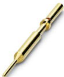
Crimp contact, turned, Contact diameter: 0.6 mm, Crimp range: 0.08 mm 2 ...0.25 mm 2

Please be informed that the data shown in this PDF Document is generated from our Online Catalog. Please find the complete data in the user's documentation. Our General Terms of Use for Downloads are valid ( http://phoenixcontact.com/download )