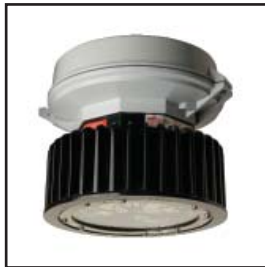
Champ® VMV LED

Can be used with the following LED luminaires: