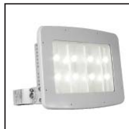
Champ® FMV LED