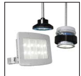
Pro Series LED