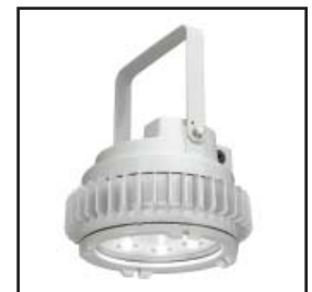
Hazard•Gard® LPL LED