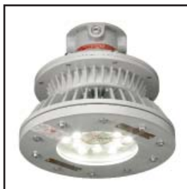
Hazard•Gard® EVLL LED

Can be used with the following LED luminaires: