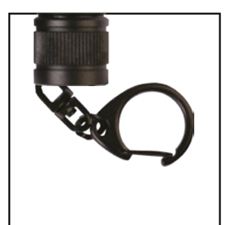
> Keyring Chain For Portability