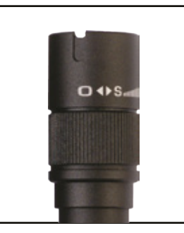
> Twist Head Focus Control