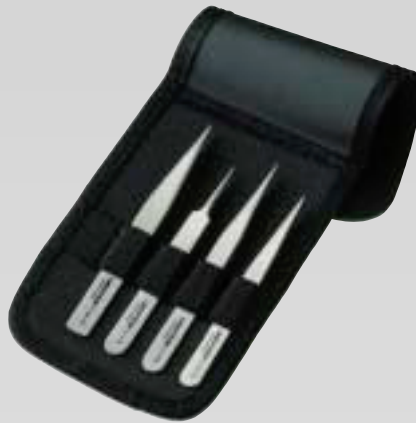
Titanium tweezer set, 4 pcs