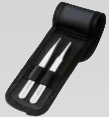
Strong tip tweezer set, 2 pcs