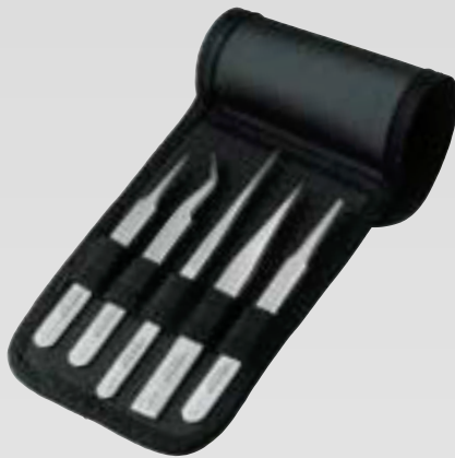
General purpose tweezer set, 5 pcs