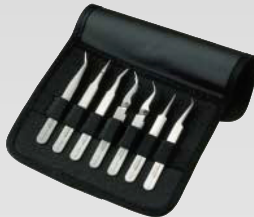
SMD tweezer set, 7 pcs

Since 1856, Lindstrom has developed and refined precision hand tools to perfection. Our tweezers offer optimal balance, tip alignment, and symmetry as well as a wide variety of materials and designs to meet the most sophisticated and demanding requirements.