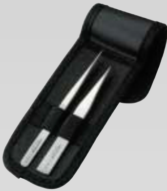
Fine tip tweezer set, 2 pcs