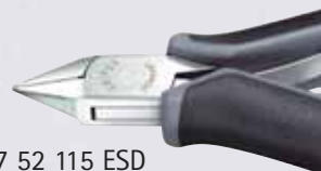
77 52 115 ESD pointed, flat head, with small bevel