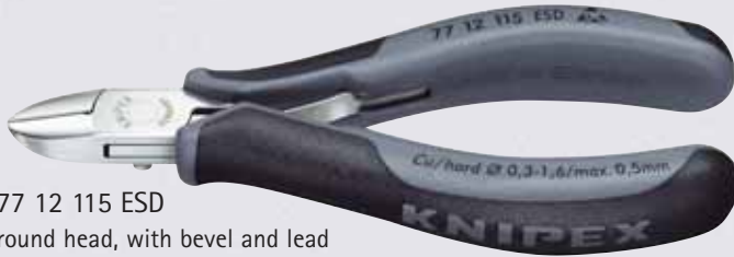
77 12 115 ESD round head, with bevel and lead catcher - no uncontrolled loss of cut wire ends