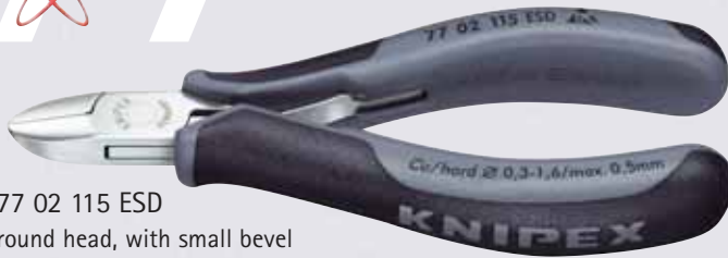
77 02 115 ESD round head, with small bevel