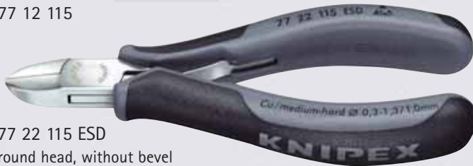
77 22 115 ESD round head, without bevel