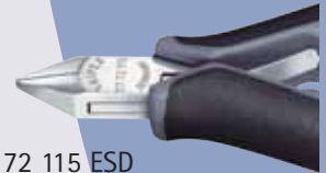
77 72 115 ESD pointed mini-head, with small bevel