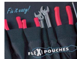
Flexipouches™. patented system featuring elastic band on top of the pouch to ensure tools always in place

Additional tool pallet, available as accessory upon request