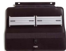
Front with PSS, back with elastics

Additional tool pallet, available as accessory upon request