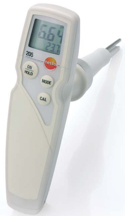
Robust food penetration pH/°C meter with automatic temperature compensation