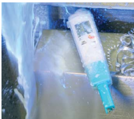
The "TopSafe" case protects in tough industrial conditions