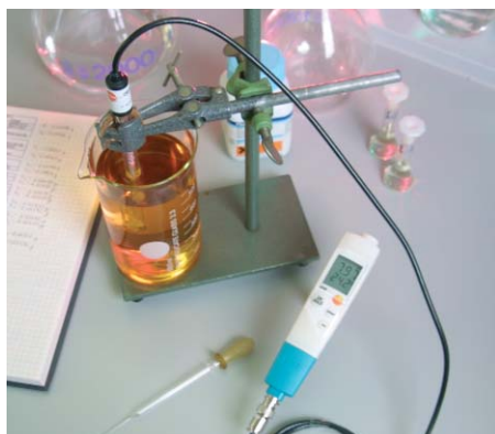
testo 206-pH3 facilitates the connection of external pH probes