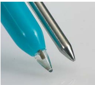
pH2 probe head for semi-solid substances

Together with experts from trade and industry, Testo has developed innovative instruments that resolve these problems.