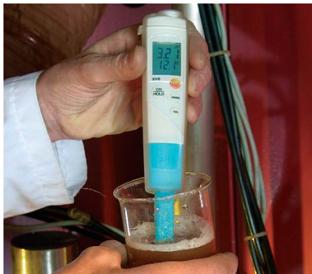
testo 206-pH1 is ideal for measurements in liquids