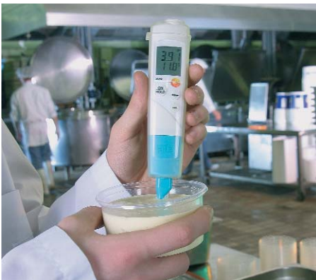
testo 206-pH2 is ideal for measurements in viscoplastic substances.