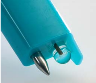
pH1 probe head for liquids

Measurement of the pH value plays an important role in many areas. Anywhere where there are chemical and biochemical reactions, the pH value has an important indicator function.