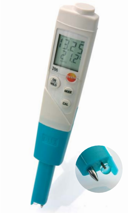
pH1 probe head for liquids