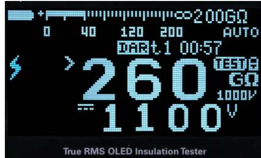
Figure 5. Adjustable insulation test voltage up to 1.1 kV

The adjustable insulation test voltage from 10 V to 1.1 kV in 1 V steps on selected two models 1 allows you to set precise test voltages catered to unique test application requirements. These typical applications are commercial avionics testing, military communications system testing and production line testing. The standard test voltages from 50 V to 1 kV is also available for selected models 2 .