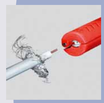
Stripping the conductor of a Coax-cable