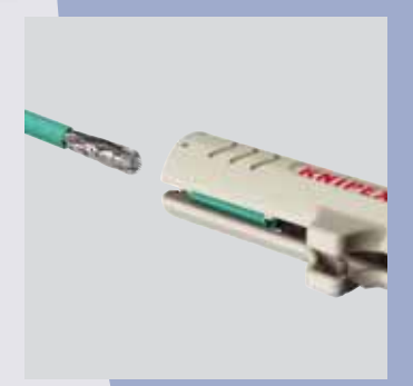
Stripping of UTP/STP data cables between 5.0 – 15.0 mm dia.