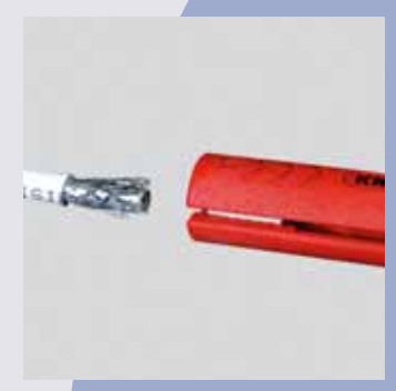
Dismantling a Coax-cable 4.8 – 7.5 mm Ø