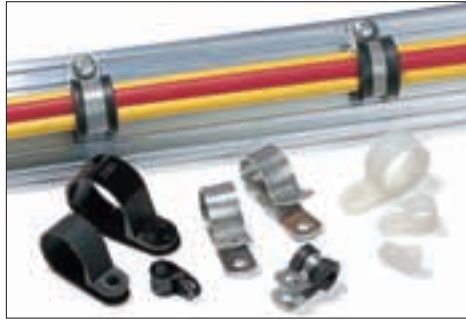
P-Clips manufactured in polyamide, aluminium, or aluminium with a chloroprene insert.