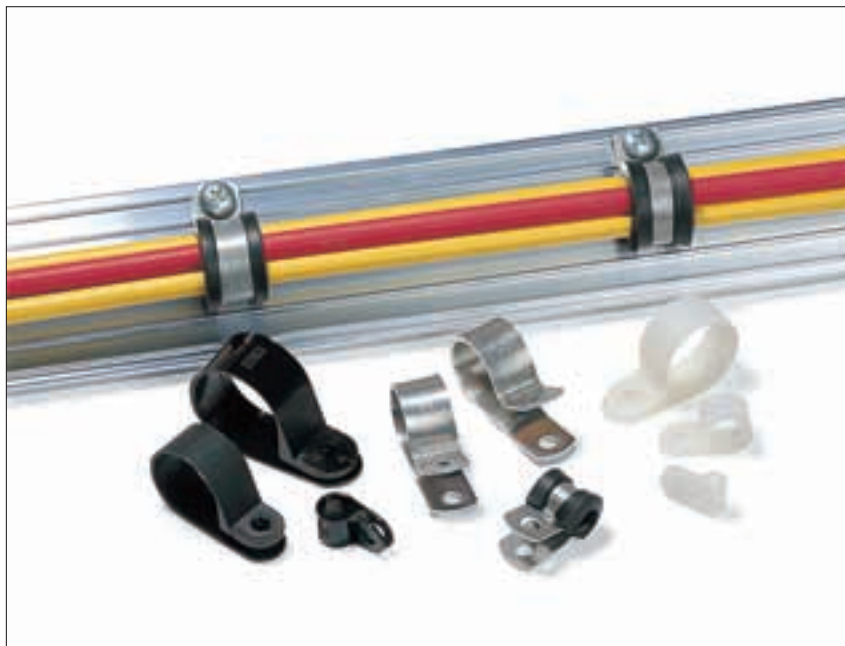
P-Clips manufactured in polyamide, aluminium, or aluminium with a chloroprene insert.

Manufactured from a high quality aluminium these P-Clips provide flexibility and yet give a permanent fixing in the most arduous environments. The addition of a Chloroprene insert provides the cable or pipe bundle with a high degree of protection against vibration, reduces noise and also offers electrical isolation.