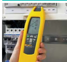
Location of fuses/breakers and assignment to circuits