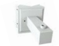
CBR Corner Mount Bracket