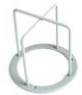
92-GRD Lens Guard