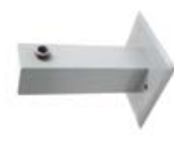
WBR Wall Mount Bracket