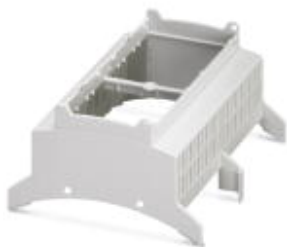
Installation component housing, Upper part, Cross connection: Component housing, Color: light gray, Width: 107.6 mm, Constructional height: 62.2 mm

Please be informed that the data shown in this PDF Document is generated from our Online Catalog. Please find the complete data in the user's documentation. Our General Terms of Use for Downloads are valid ( http://phoenixcontact.com/download )