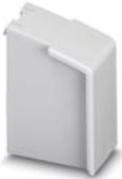
Component housing, Color: light gray

Please be informed that the data shown in this PDF Document is generated from our Online Catalog. Please find the complete data in the user's documentation. Our General Terms of Use for Downloads are valid ( http://phoenixcontact.com/download )