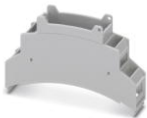
Installation component housing, Upper part, Color: light gray, Width: 17.8 mm, Constructional height: 62.2 mm

Please be informed that the data shown in this PDF Document is generated from our Online Catalog. Please find the complete data in the user's documentation. Our General Terms of Use for Downloads are valid ( http://phoenixcontact.com/download )