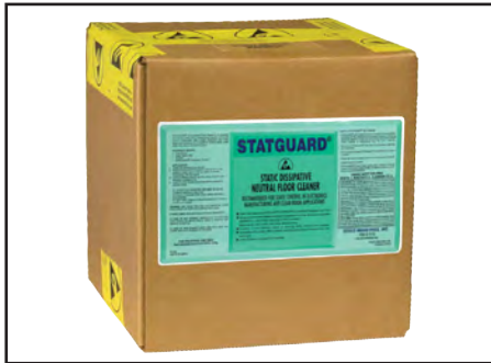
Figure 1. Statguard® Dissipative Neutral Floor Cleaner