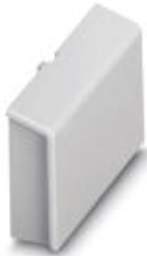
Component housing, Color: light gray

Please be informed that the data shown in this PDF Document is generated from our Online Catalog. Please find the complete data in the user's documentation. Our General Terms of Use for Downloads are valid ( http://phoenixcontact.com/download )