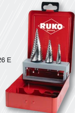
No. 101 026 E