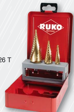
No. 101 026 T