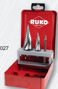
No. 101 027