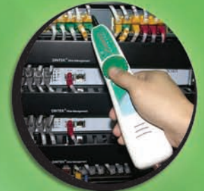
Validate twisted pair cables ( ex. UTP, STP )