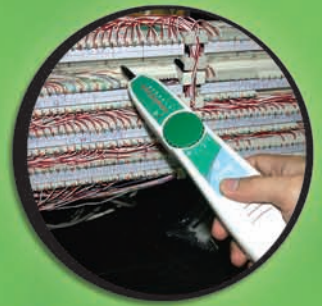
Locate & isolate cables