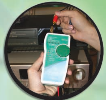
Antennas and cable TV hookups