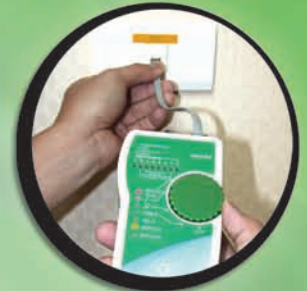
Ethernet detection (10 base-T or 10/100 Base T)