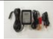
Battery Fighter® Junior