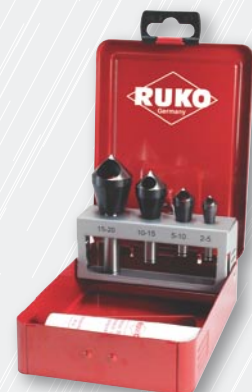
No. 102 312 E