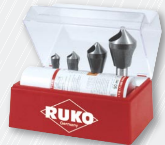
No. 102 310 E