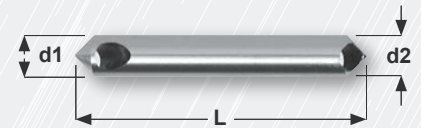
No. 102 300 E

Peeling cut. Chip removal through the slot prevents chips from clogging the workpiece. Ideal for burr- and chatter-free deburring and countersinking. Applicable for steel, cast iron, non-ferrous and light metals. Best results at low cutting speeds.