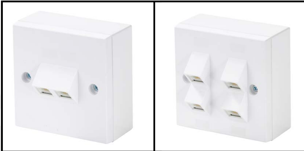
Category 5e 2 Port and 4 Port Angled Face Plate (FJ2-45 + FJ4-45)

Compact and convenient 2 and 4 port one piece Category 5e faceplates with angled jacks. Both versions fit standard 86x86 back box