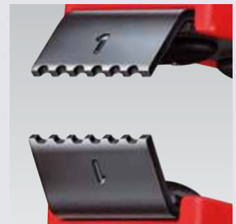
Precisely milled blades for clean stripping