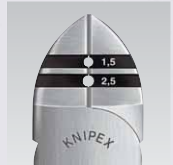
Multi-functional: cutting and stripping