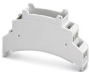
Installation component housing, Upper part, Color: light gray, Width: 17.8 mm, Constructional height: 62.2 mm

Please be informed that the data shown in this PDF Document is generated from our Online Catalog. Please find the complete data in the user's documentation. Our General Terms of Use for Downloads are valid ( http://phoenixcontact.com/download )