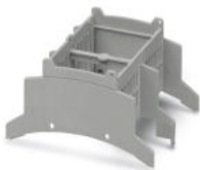
Installation component housing, Upper part, Color: light gray, Width: 71.6 mm, Constructional height: 62.2 mm

Please be informed that the data shown in this PDF Document is generated from our Online Catalog. Please find the complete data in the user's documentation. Our General Terms of Use for Downloads are valid ( http://phoenixcontact.com/download )