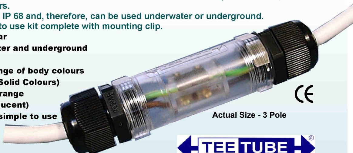
Actual Size - 3 Pole