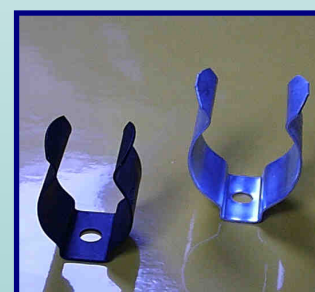
Snap fit Mounting Clips