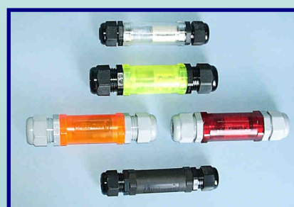
A Selection of the colour options available