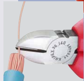
Cuts fine wires cleanly over the complete length of the blades