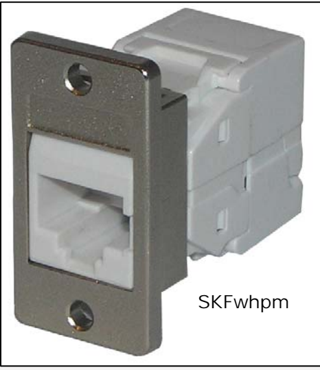
CAT6 tool-less component level keystone (SKF*)

Our Category 6 jack offers a tool-less keystone solution for any Category 6 requirement, available in various colours and also as a panel mount version (SFK*pm).