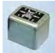
Mumetal Can W29 H23 D24mm