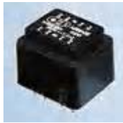
Transformer W28 H22 D23mm

An optional Mu-metal screening can, is available if required. P/N A262CAN)