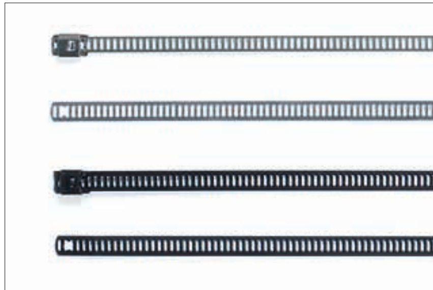
Stainless Steel Cable Ties can be used at temperatures up to 538° C.

The MAT ties are similar in design to conventional 'plastic' cable ties and work on a ratchet system. Available in type 316 stainless steel.