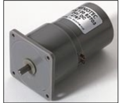
Gear motor data