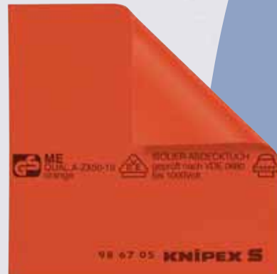
98 67 05