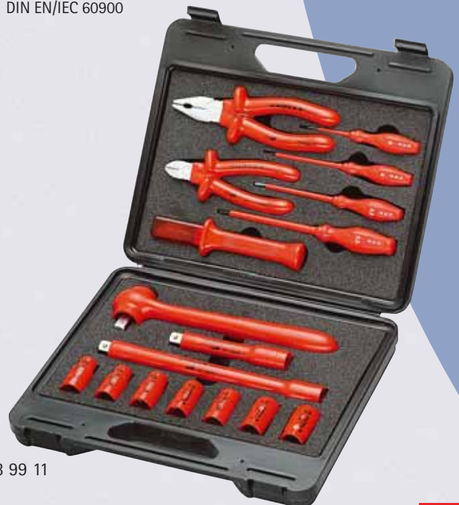
98 99 11