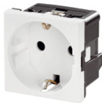
Power - sockets

FrontCom® Vario integrates multiple functions in only one single frame. The system is easy to install and you can select from a wide range of data, signal and power modules. In addition to being extremely compact, FrontCom® Vario offers a number of unique product features that will make your project planning and work activities secure, fast and future-proof. Furthermore, the FrontCom® Vario system has an attractive housing design that, by the way, offers highest impact-resistance and fully meets the requirements of IP 65 protection class.