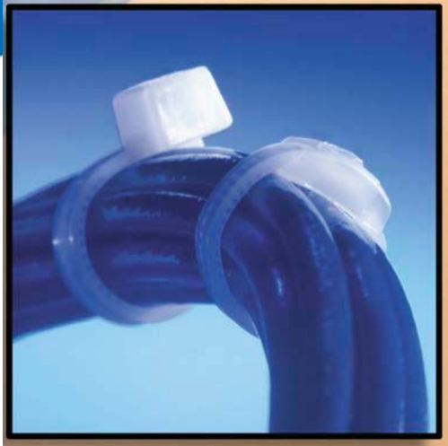
Low profile contoured head compared with the profile of the traditional T&B® Cable Tie.