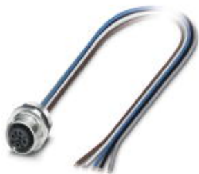
Sensor/actuator flush-type socket, 5-pos. M12, A-coded, front/screw mounting with M16 thread, with 0.5 m TPE litz wire, 5 x 0.34 mm 2 , stainless steel version

Please be informed that the data shown in this PDF Document is generated from our Online Catalog. Please find the complete data in the user's documentation. Our General Terms of Use for Downloads are valid ( http://phoenixcontact.com/download )