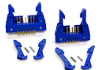
Header Latch Kit